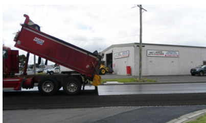
② Tip truck spreading aggregate