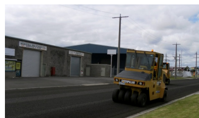
③ Multi wheeled roller used to embed the aggregate