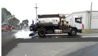
① Tanker applying spray seal

We will reseal your road during the warmer months. Works generally start in October and are completed by March. You will receive a notification shortly before the works are to be completed on your road.