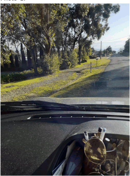
Current dirt and gravel footpath along Wirraway Street Extension to bus stop.