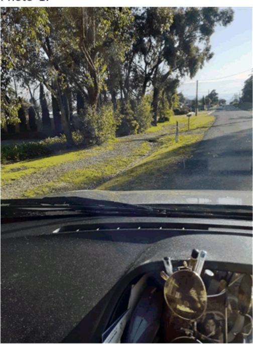
Current dirt and gravel footpath along Wirraway Street Extension to bus stop.