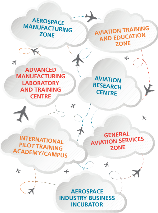
Map of land use concept areas of Latrobe Regional Airport

AIRPORT RUNWAY IS DESIGNATED A CODE B (1430 X 23 METRES) WITH PROVISION FOR A FUTURE CODE C RUNWAY (1680 X 30 METRES) IN MASTER PLAN. NEW LED RUNWAY LIGHTING WITH PRECISION APPROACH PATH INDICATOR (PAPI) SYSTEM AND APRON LIGHTING HAS RECENTLY BEEN INSTALLED