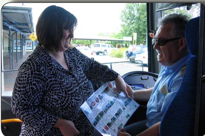
Bus user using Communication board