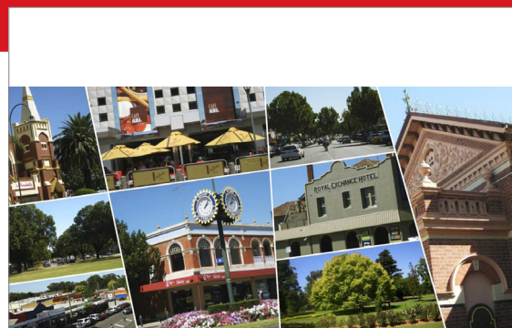
traralgon activity centre plan key directions report

The Traralgon Activity Centre Plan project will now focus its attention on progressing these two key directions over the next few months.