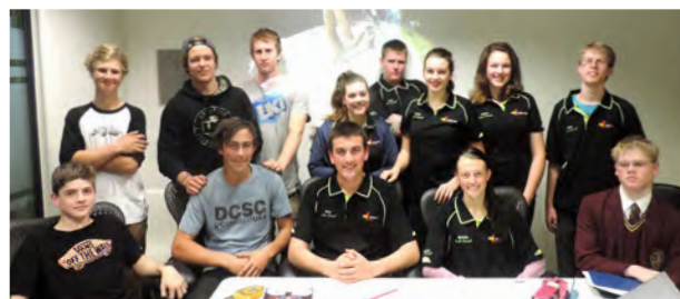
Image credits (top to bottom): Latrobe Says Thanks event, Latrobe City Youth Council 2014, Latrobe City Youth Council 2014 meeting with skate park users.