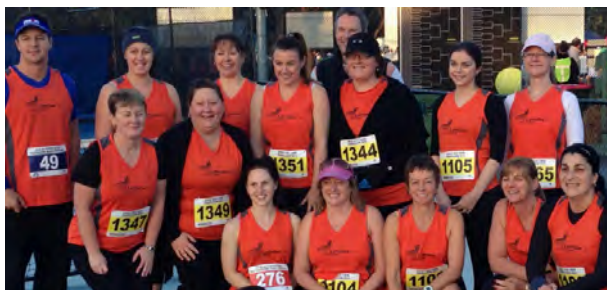
Image credits (left to right, top to bottom): Latrobe City Council's 'Team Latrobe', Latrobe City Council Early Learning Centre and Meals on Wheels volunteers.

During 2013/14, 55 employees celebrated notable lengths of service with Latrobe City.