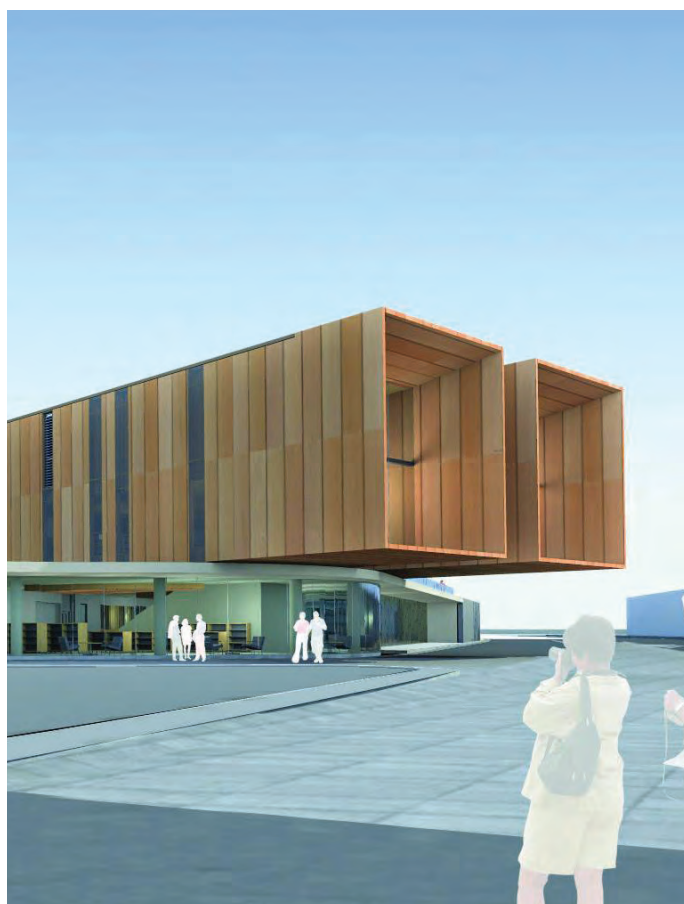
Image credit: Moe Rail Precinct Revitalisation Project concept illustration