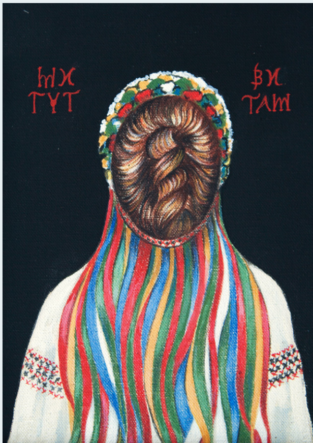
Erica Kurec, We are here - you are there , 2001. Egg tempera Gouache on canvas. 29 x 23 cm.

For more information visit: latroberegionalgallery.com