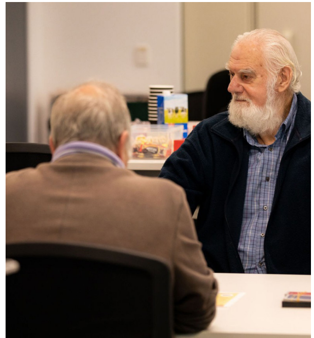
Pictured: Blokes & Banter

https://bit.ly/lcclibrarysocialconnection