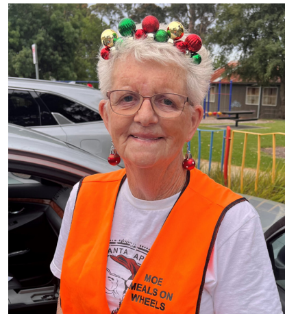
2026 Award Nominee – Senior Citizen of the year