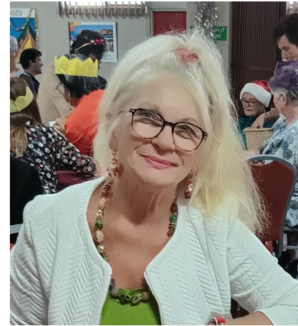
2026 Award Nominee – Senior Citizen of the year