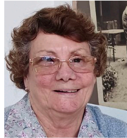
2026 Award Nominee – Senior Citizen of the year