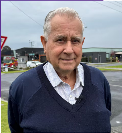
2026 Award Nominee – Senior Citizen of the year