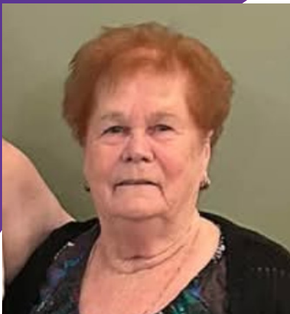
2026 Award Nominee – Senior Citizen of the year