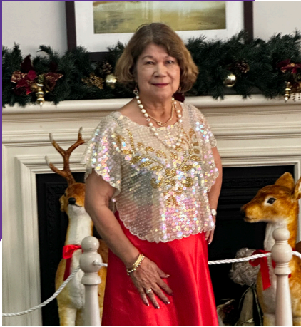
2026 Award Nominee – Senior Citizen of the year