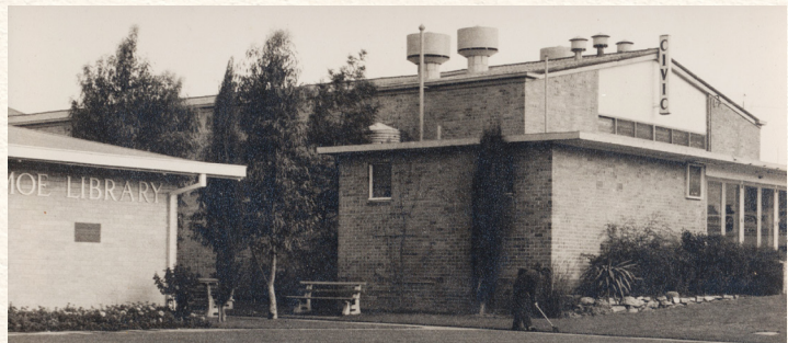
Moe Civic Theatre.

Steam trains were starting to be phased out, with one of the last runs occurring from Warragul to Traralgon.