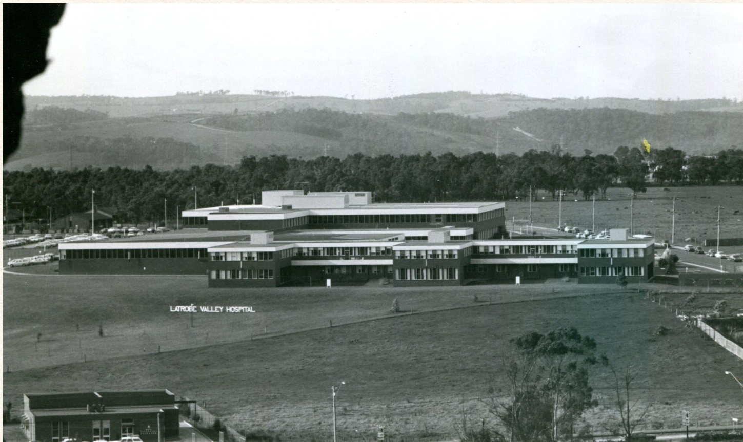
Latrobe Valley Community Hospital, Newborough.

We thank the Latrobe Valley Express for their continued service and look forward to seeing the newspaper thrive for many years to come.