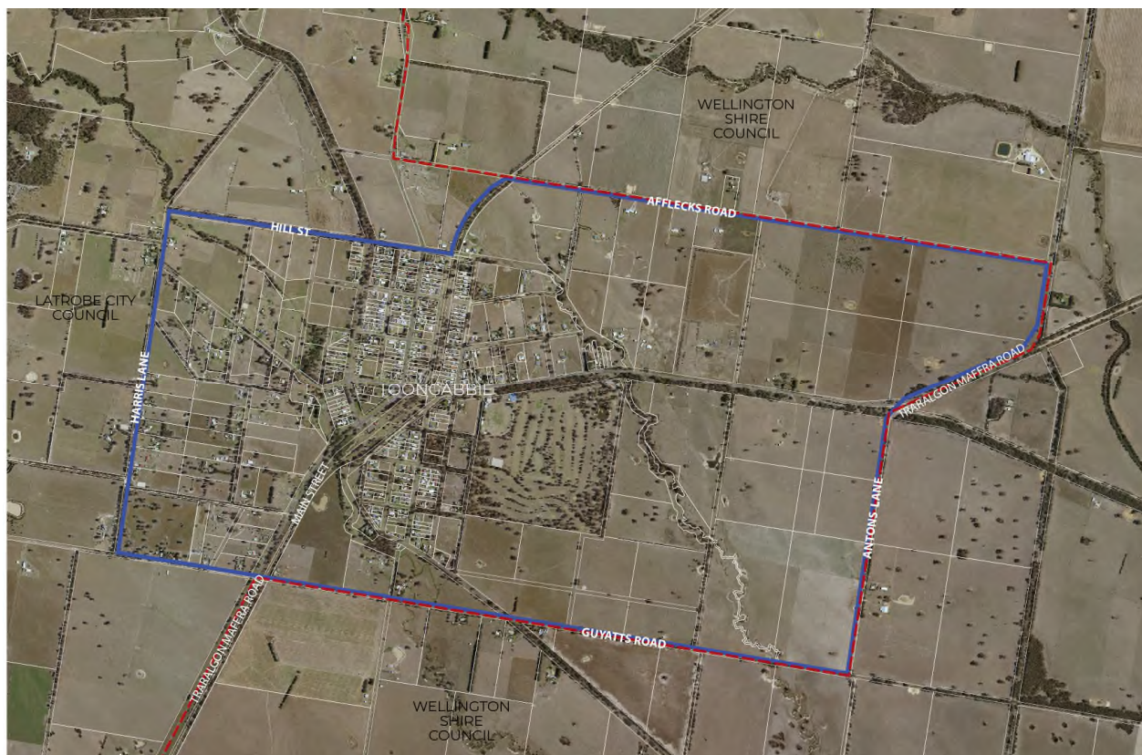
Figure 1: Land generally affected by the Amendment

The Amendment also applies to adjacent properties to the west and the north-west of the area shown in Figure 1 by making changes to the Land Subject to Inundation Overlay (LSIO) and introducing the Floodway Overlay (FO) (refer land shown as FO and LSIO in Figure 2 in Attachment 1).