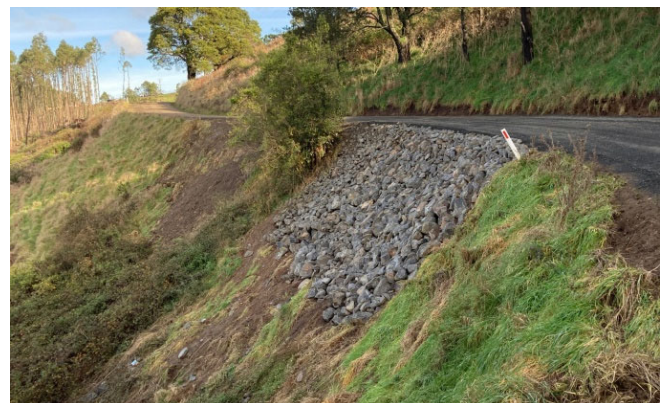
Figure 4 - Whitelaw's Track AFTER