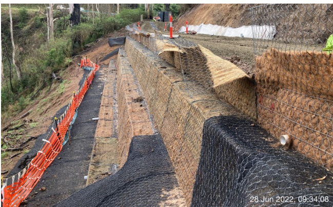
Figure 2 - photo of incomplete reinforced soil structure on Upper Middle Creek Road

On Upper Middle Creek Road, Fulton Hogan, on behalf of Council, is constructing a reinforced soil structure using Macmat, Green Terramesh, including Biomac, and concrete canvas drainage.