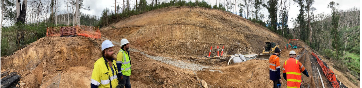
Figure 1 - Panorama of worksite on Upper Middle Creek Road in mid-May