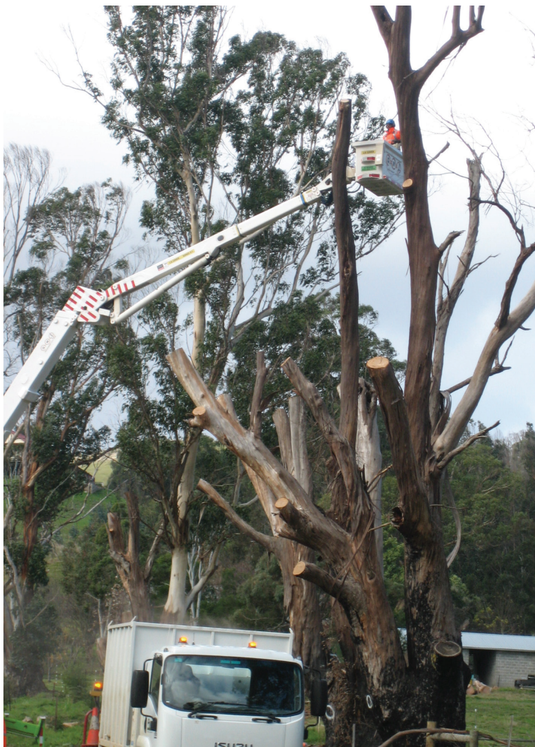
Photo: AusNet contractors pruning the dead and dangerous trees on Healeys Road.

The course can be accessed at https://bushfireprepare.online/