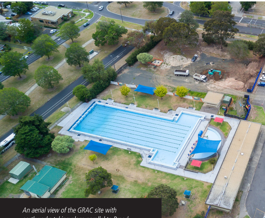
An aerial view of the GRAC site with earthworks taking place parallel to Breed Street.