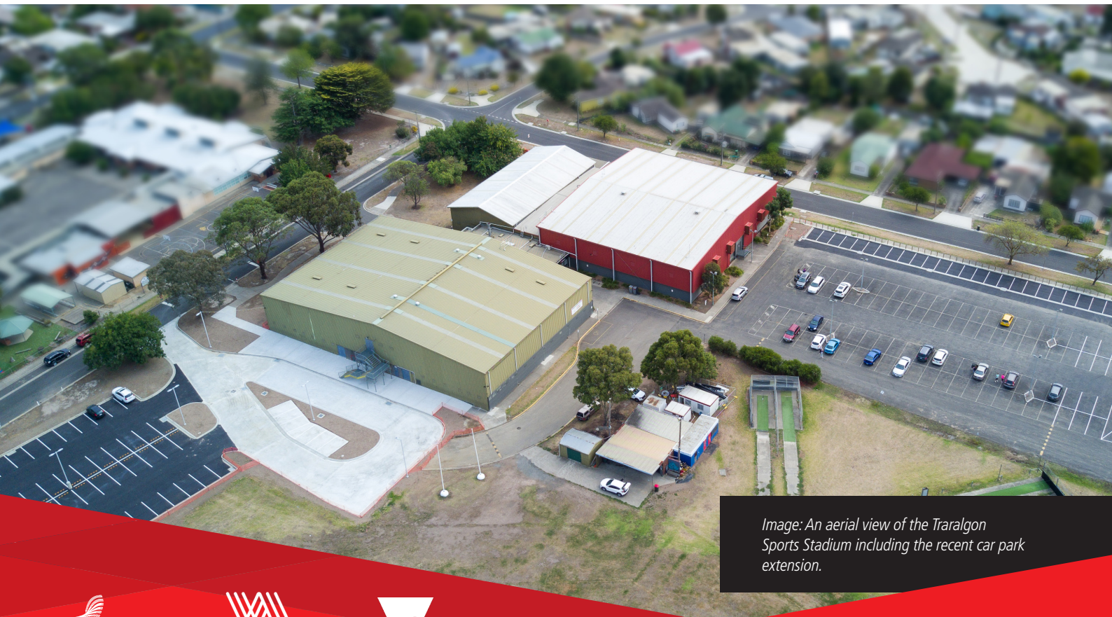
Image: An aerial view of the Traralgon Sports Stadium including the recent car park extension.