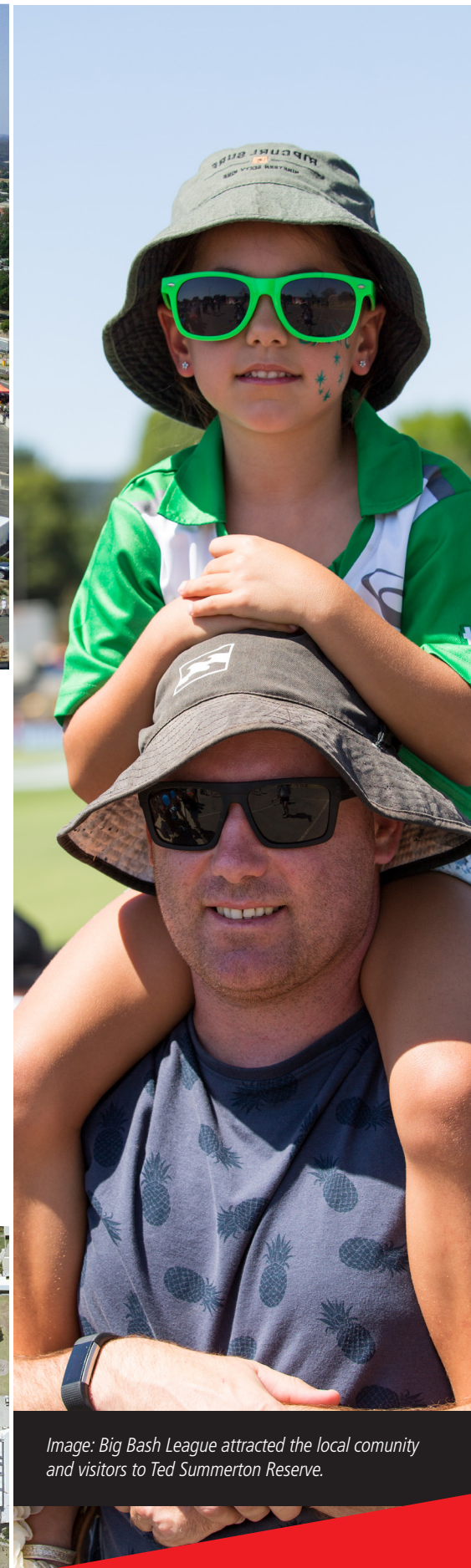
Image: Big Bash League attracted the local community and visitors to Ted Summerton Reserve.