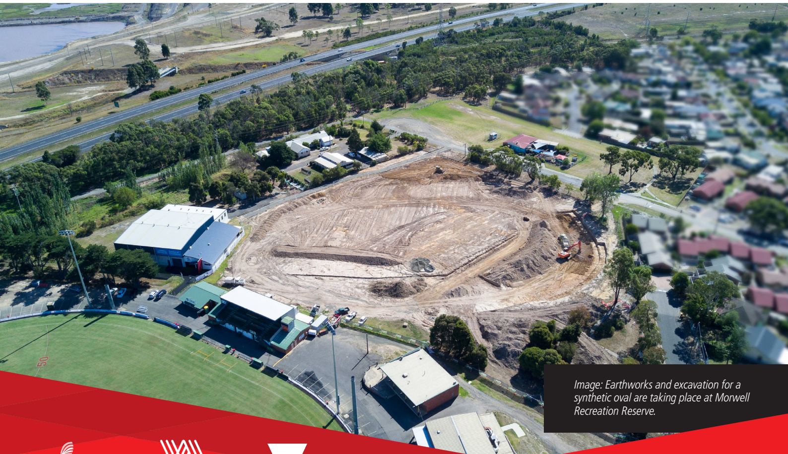
Image: Earthworks and excavation for a synthetic oval are taking place at Morwell Recreation Reserve.

For updates on the Morwell Recreation Reserve visit www.latrobe.vic.gov.au/MRR