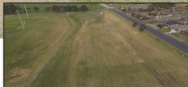
Image: The existing site, prior to works existing

The State Government provided $1.7 million for upgrades to the facility as part of the LVSCI.