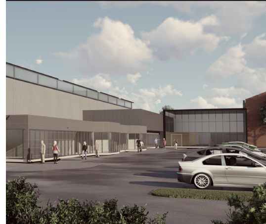
Image: An artist impression of the Traralgon Sports Stadium

For updates on the Traralgon Sports Stadium visit www.latrobe.vic.gov.au/TSS