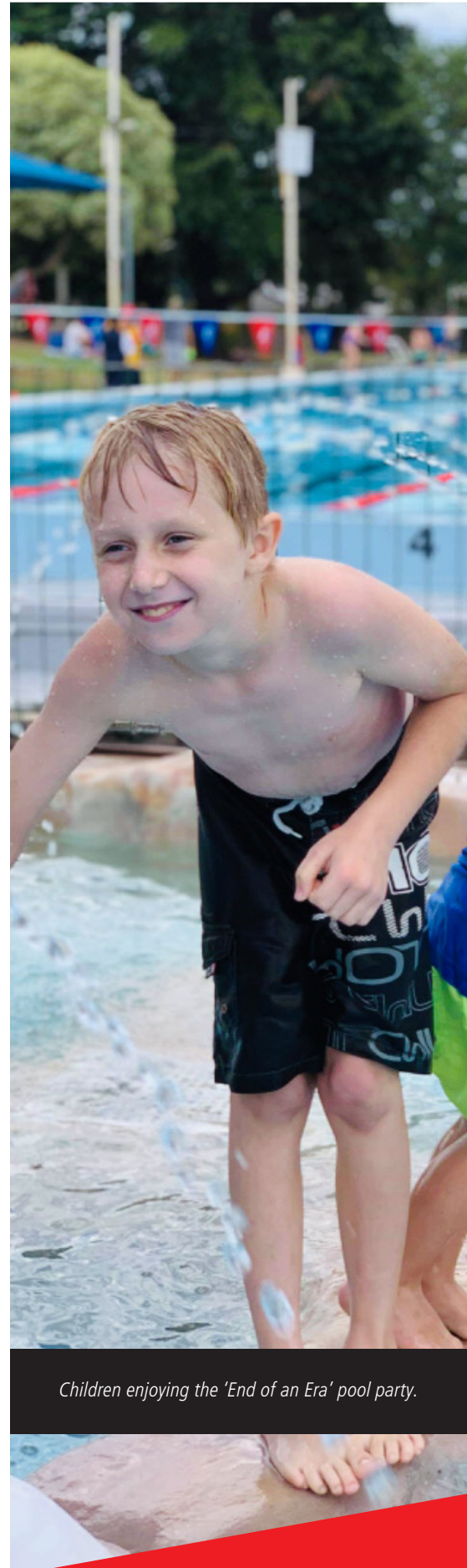
Children enjoying the 'End of an Era' pool party.

For updates on the Gippsland Regional Aquatic Centre visit www.latrobe.vic.gov.au/GRAC