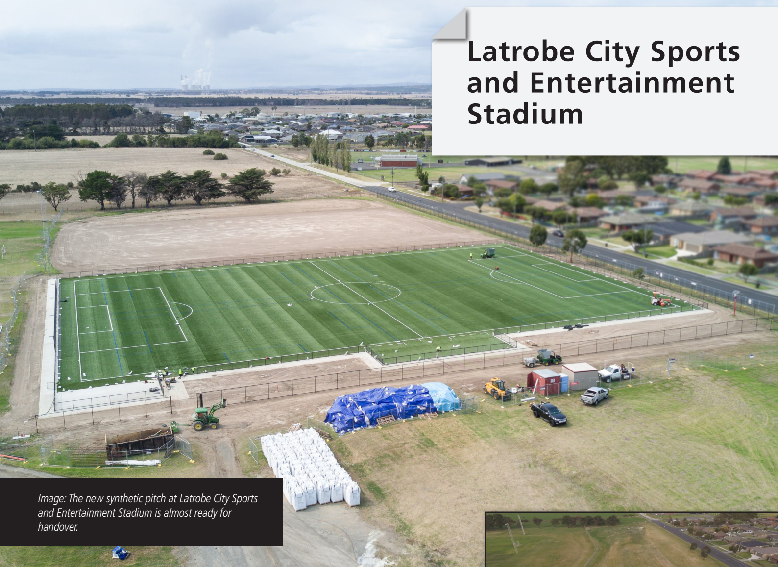
Image: The new synthetic pitch at Latrobe City Sports and Entertainment Stadium is almost ready for handover.