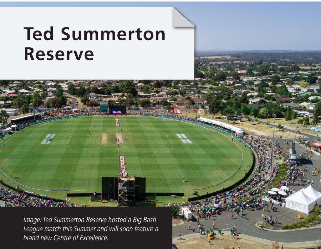
Image: Ted Summerton Reserve hosted a Big Bash League match this Summer and will soon feature a brand new Centre of Excellence.