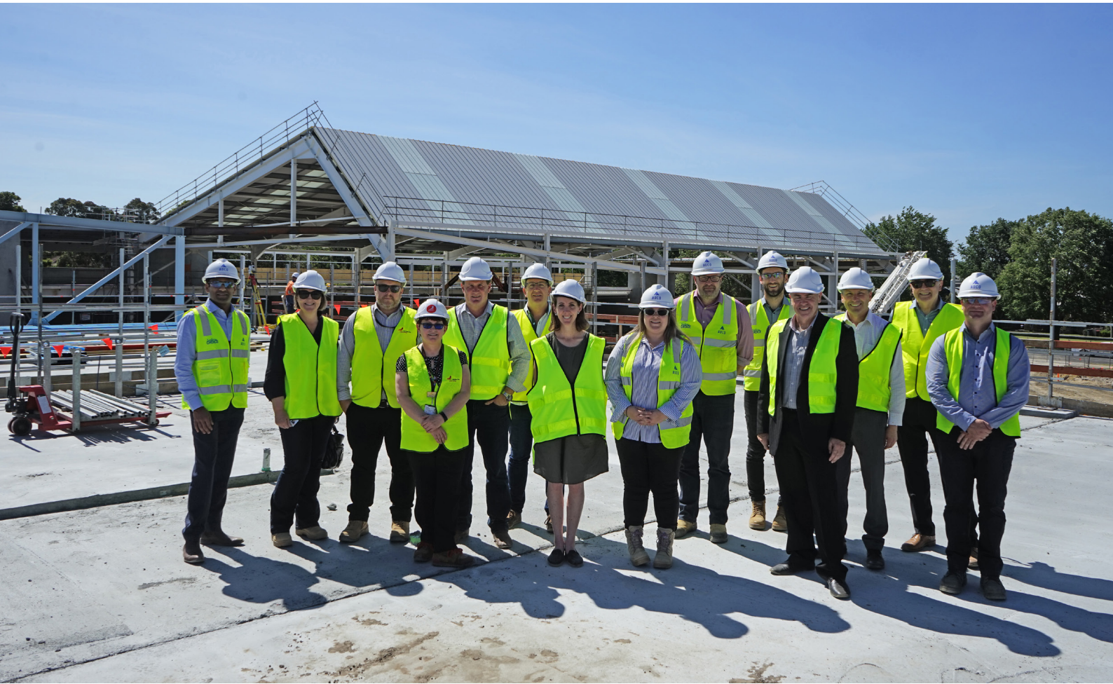
Above: LVA, SRV and ADCO staff, along with Project Reference Group members in front of the completed roof over the 50m pool.