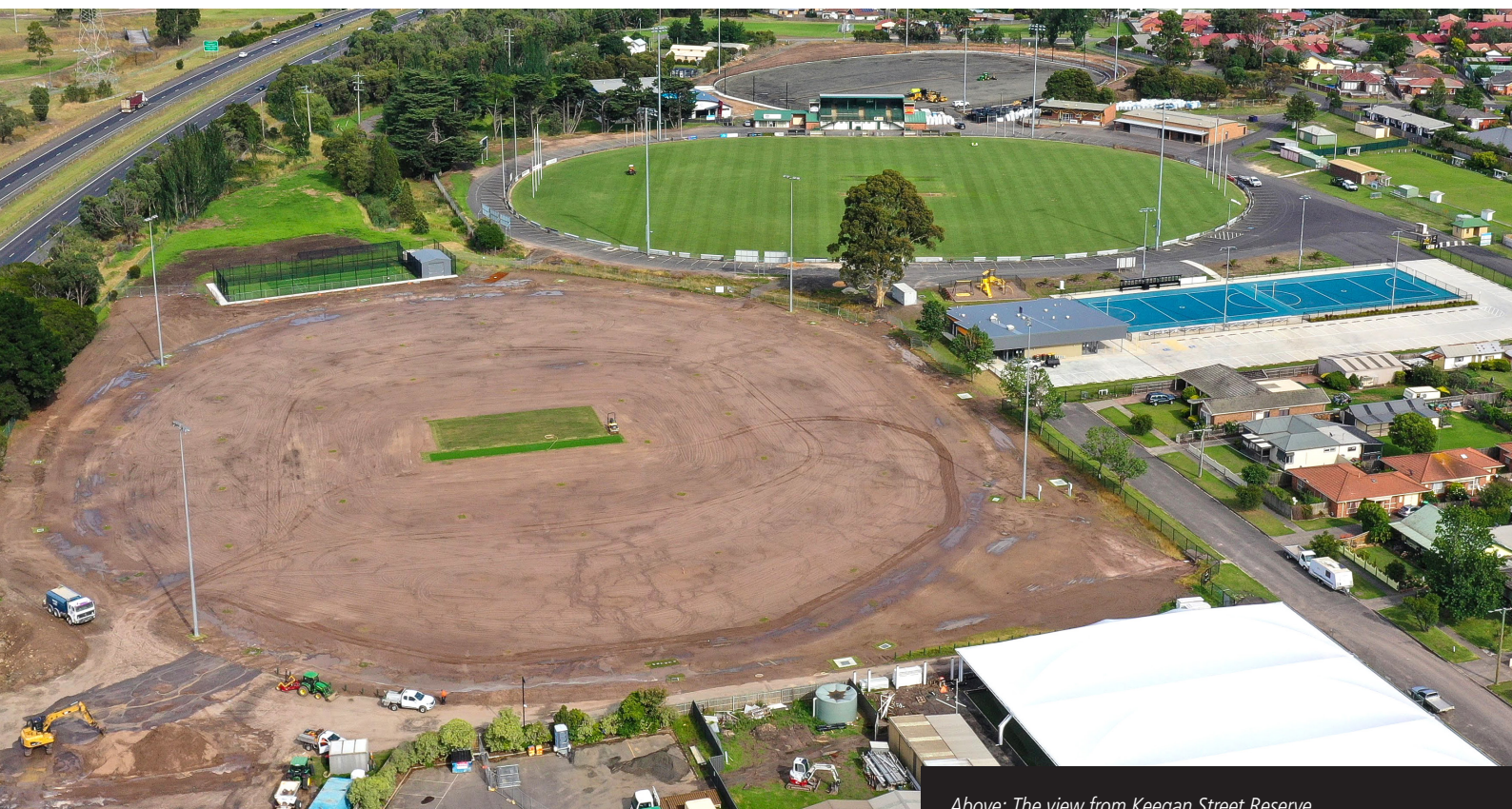
Above: The view from Keegan Street Reserve.