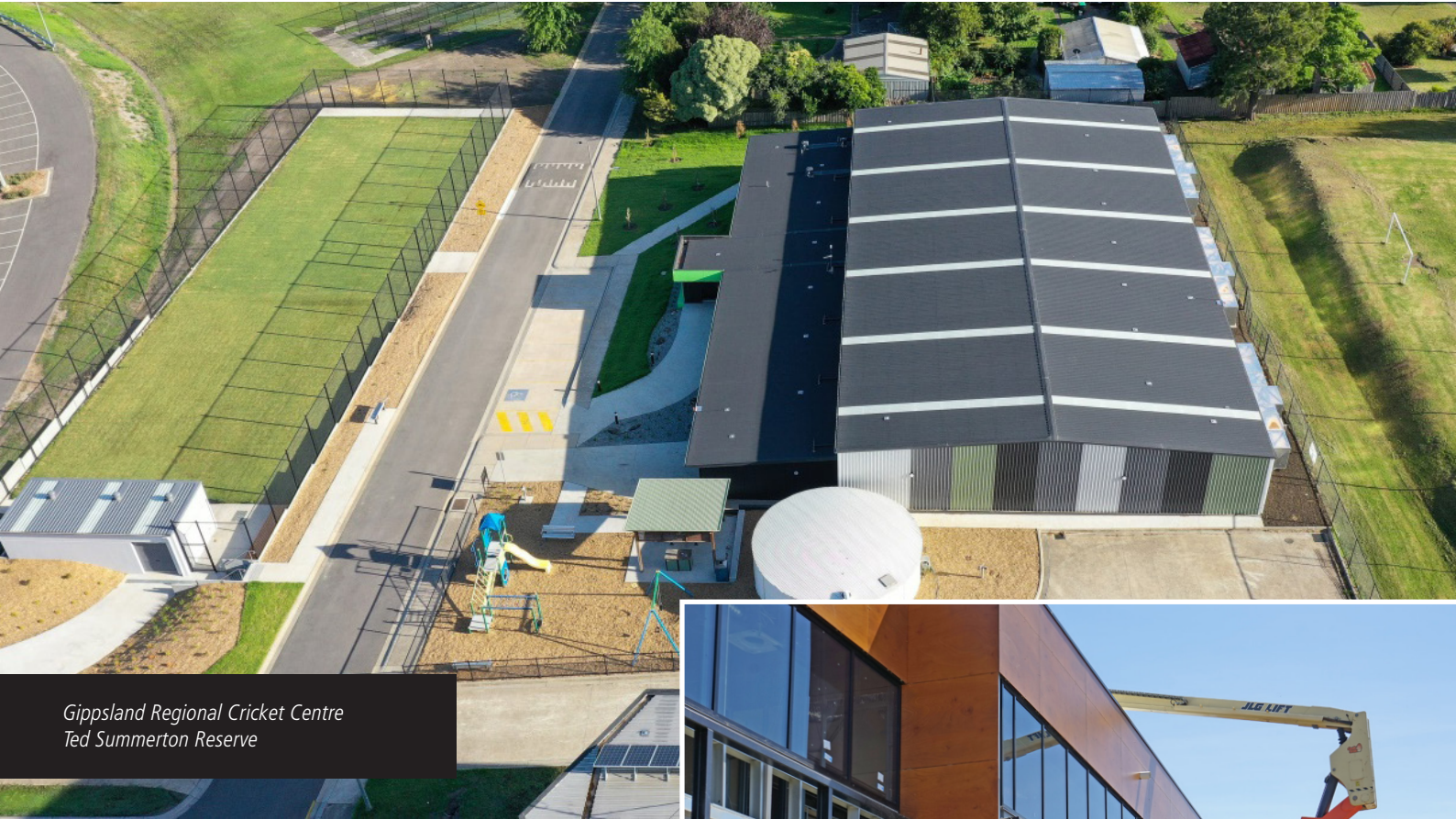
Gippsland Regional Cricket Centre Ted Summerton Reserve