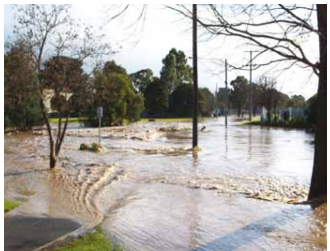
Franklin St Bridge, Traralgon 2007